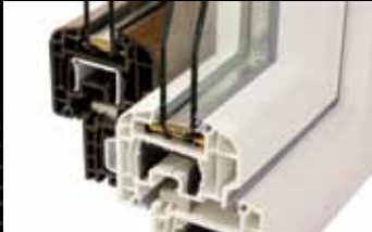
WINDOWS / DOORS