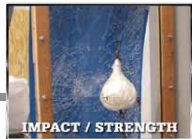
IMPACT / STRENGTH