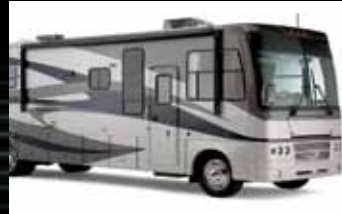
RV / MANUFACTURED HOMES