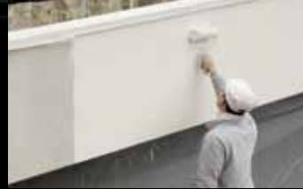
COATINGS / SURFACES