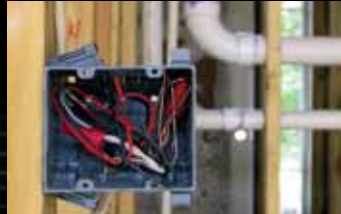
PLUMBING AND ELECTRICAL