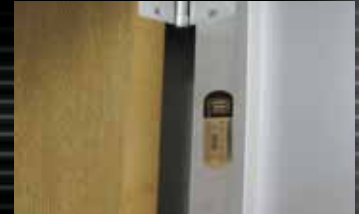
FIRE DOOR FIELD LABELING